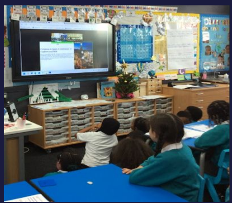
Year 4 had a zoom with a previous SN teacher and her class from Egypt. We learnt how coptic Christians celebrate Christmas in Egypt and told them about our winter festivals.